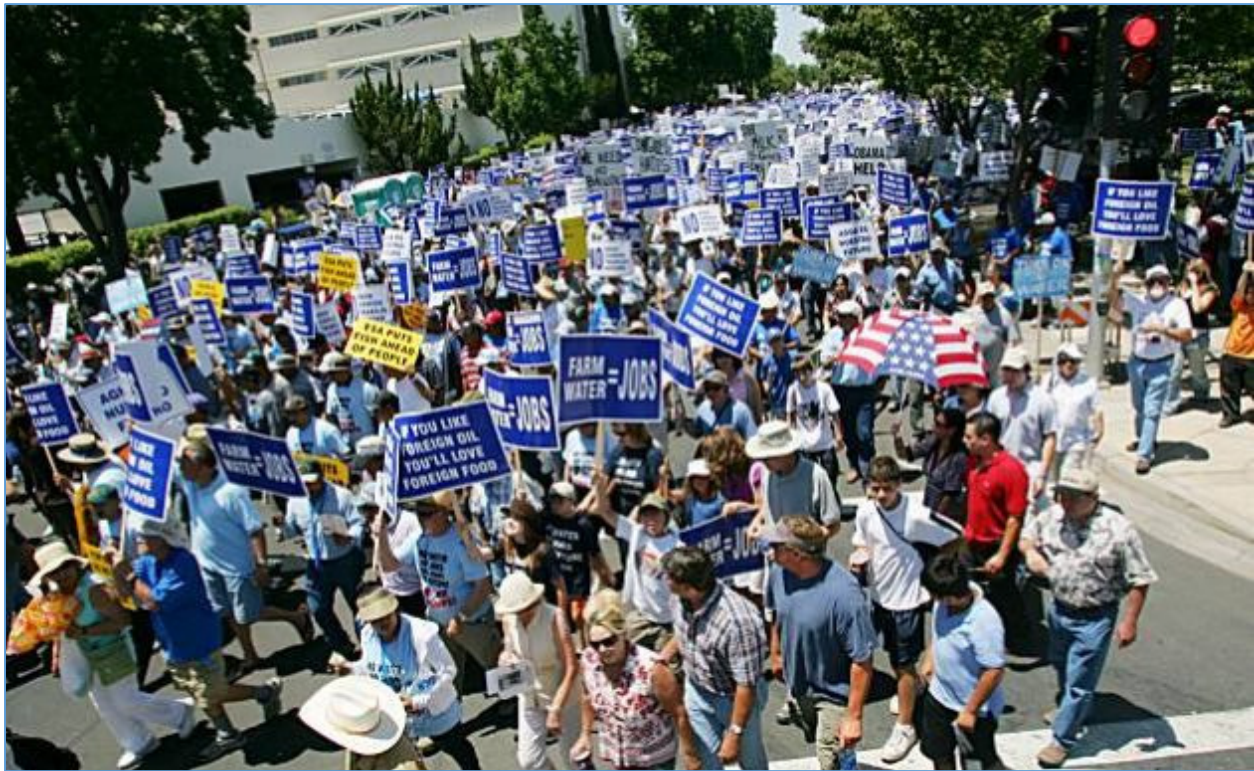
Thousands of farmers, farm workers and supporters march to protest water shortages, driven in part by agency implementation of the ESA, July 2009 in Fresno, Calif.

Similar impacts were felt on an even greater magnitude by irrigators and communities in the San Joaquin Valley in 2009, and will be felt again this year throughout the Central Valley, in a state where Bay-Delta water is deemed by policy makers to be more important to ESA-protected smelt than to farmers and ranchers. In both the Klamath and San Joaquin Valley instances, tremendous impacts were felt by landowners, water users, their local communities, other species and the environment, while benefits to the “listed” species of concern were questionable at best, or even unknown.